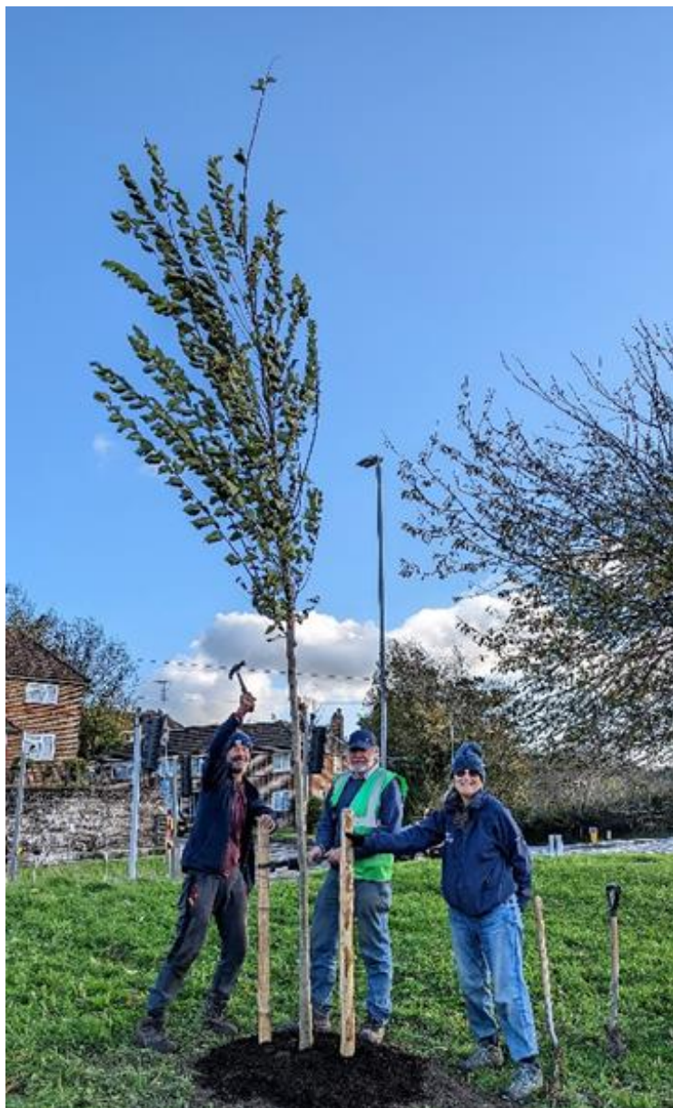
Prince Charles Road

This brings the total number of street trees we have planted in Lewes to 135, and you can see where we have planted them on the map on the Friends of Lewes website: https://friends-of-lewes.org.uk/natural-environment/lewes-urban-arboretum/