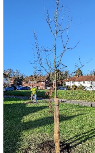
Fitzgerald Road verge

Around the corner in Queen's Road, we planted a Liriodendron tulipifera , (Tulip tree), which is huge! Then, moving on to Barn Road, we planted an Acer campestre Lienco, (Field Maple), a Malus baccata "Street Parade", (Crab Apple), and a Pyrus calleryana Chanticleer, (Ornamental Pear).