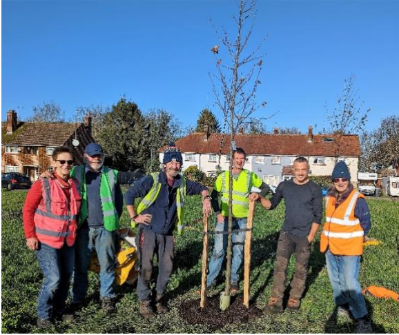
Fitzgerald Road green

In Fitzgerald Road, we planted three Sorbus intermedia Brouwers, (Whitebeam), and two Alnus incana , (Alder), on the corner of the green. On the nearby verge we planted a Cercis siliquastrum , (Judas tree), and an Amelanchier lamarckii , (Juneberry), either side of an existing Cherry.